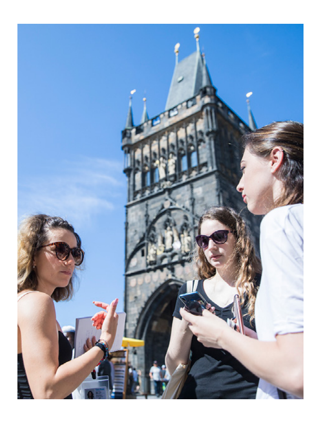
Ten-day journalism summer program, August 2019